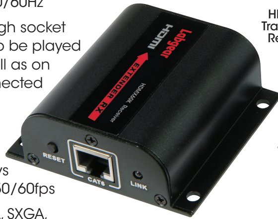
HDM-X60K Transmitter In Receiver In