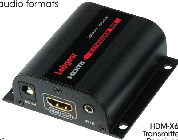
HDM-X60K Transmitter Out Receiver Out